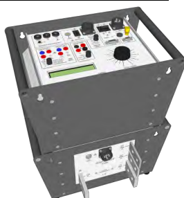
PCU1-SP and NLU5000

Where higher currents and powers are required for primary injection, 11kVA and 20kVA primary injection systems are available. The PCU1-SP and PCU2/E systems have separate control and loading units, allowing a wide range of load conditions to be covered with different loading units.