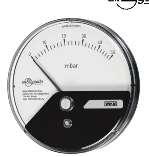
Differential pressure gauge Eco, model A2G-05