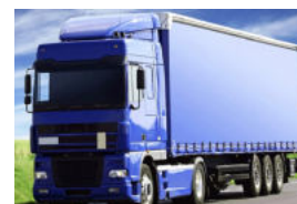
Service, Maintenance & Calibration