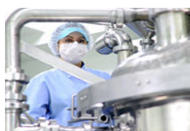
Laboratories & Clean Rooms