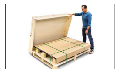
Did you know? Our floor scales are delivered in a robust wooden box. This protects the high-quality weighing technology from environmental influences and stresses during transportation. KERN – always one step ahead