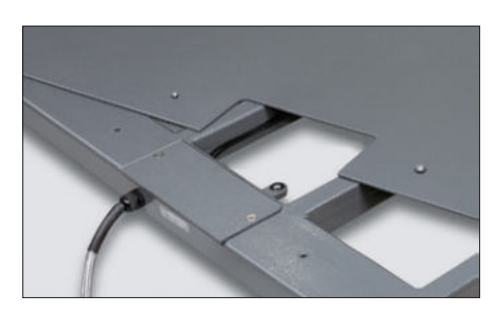
Weighing plate can be unscrewed The weighing plate can be conveniently unscrewed for maintenance or cleaning purposes (weighing plate size A, B)

Weighing bridge with screwed-on weighing plate (IP67) and XXL display device, with EC type approval [M]