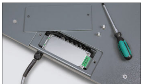
Easy levelling of the weighing bridge as well as access to the junction box from above