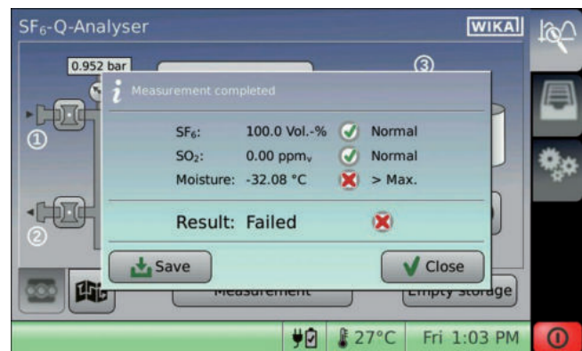
Measured value display

The GA11 makes it quick and easy to import a measuring point list, edited on a PC. Due to the complexity of the measurement task, specific knowledge is a pre-requisite, see IEC 62271-4:2013, ASTM D2029-97:2017 and CIGRÉ - SF 6 Measurement guide (723).