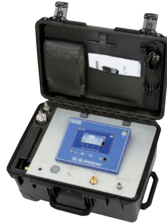
Analytic instrument model GA11