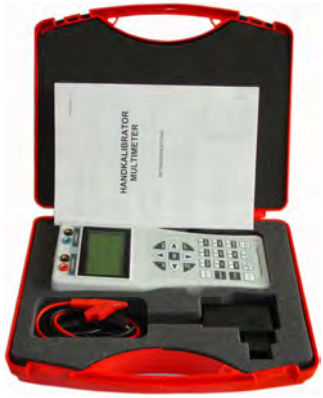
IOC505 with all accessories

Fast signals at the Multimeter input can be stored in up to 8 memory slots with a sampling rate of 1ms. Each Transient contains 256 points and can be assigned to a time period selectable from 0.25s to 300s. The trigger level is programmable