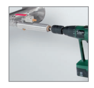
Drill under pressure with the drilling jig