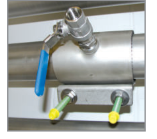
B Spot drilling collars