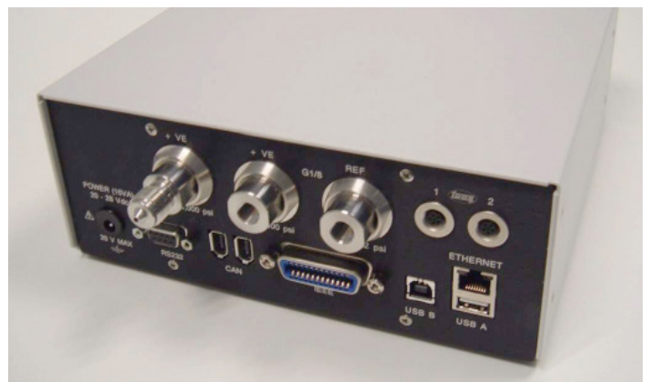
PACE1000 from the rear