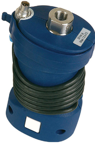
External IDOS universal pressure module

*Provides absolute pressure option in addition to gauge pressure. In absolute mode adds barometric pressure to gauge pressure range. For absolute mode ranges below 1 bar please consult your sales representative.