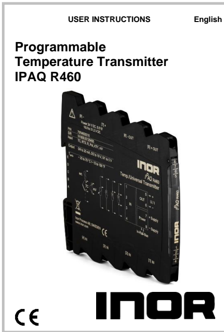
Read these instructions before using the product and retain for future information.