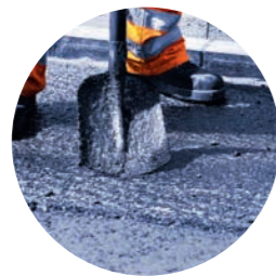
Asphalt Bitumen Tar