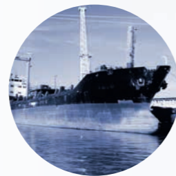
Heavy fuel oil Navy special fuel oil Bunker fuel oil