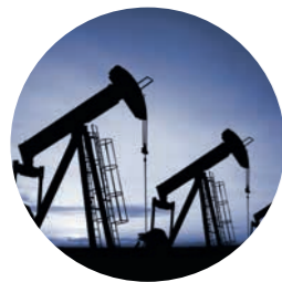
Crude oil Live crude oil