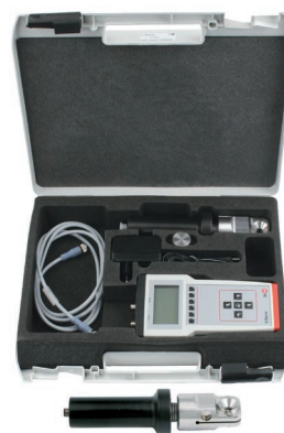
Test set for measurement of electrode forces, model FSK01