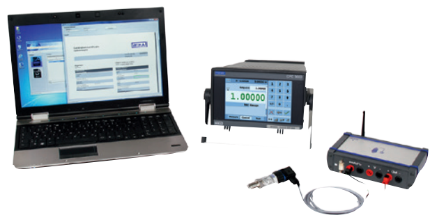
WIKA-Cal with model CPC3000 pressure controller, pressure sensor with model CPU6000-M CalibratorUnit

For details about the various pressure controllers see data sheets CT 27.40, CT 27.55, CT 27.61, CT 27.62 and CT 28.01