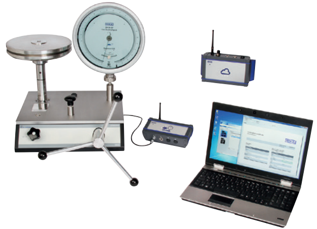
Model CPU6000-W, CPU6000-S, CPB5800 and PC with WIKA-Cal software

For details of the CPU6000 see data sheet CT 35.02 For details of the different pressure balances see data sheets CT 31.01, CT 31.06, CT 31.11, CT 31.51 and CT 31.56