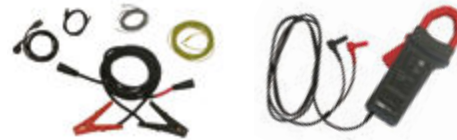
Testing cables and current clamp

Ranges: 40 A DC (10 mV/A) and 400 A DC (1 mV/A). Accuracy: 1.5% up to 40 A; 2% up to 400 A. Maximum conductor diameter: 30 mm.