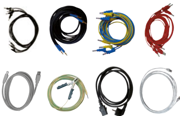
Standard set of testing cables