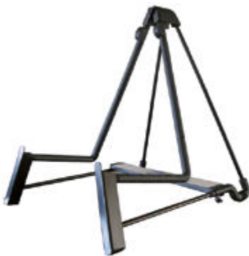
Stand up support

The stand-up support allows using the test set in a stand-up position. This is very useful in case of too small room or no support for the test set. There is enough room for the power supply cord, and for the cooling air to flow in.