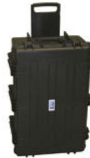
Plastic transport case