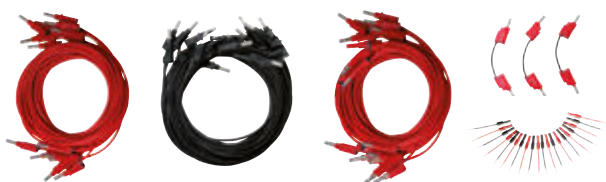
Optional set of testing cables