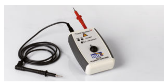
PLCK polarity checker

Checking the correct connection of CT's and VT's to protection relays is a problem because relays can be hundreds of meters away from the transformer. PLCK easilys solves the issue. When this test is started, DRTS 34 generates a special, not sinusoidal waveform, which is injected into the connection cables. The polarity check is easily performed by connecting it at the relay site. PLCK hast wo lights: green and red. The green light turns on when the polarity is correct; the red light turns on when the polarity is wrong.