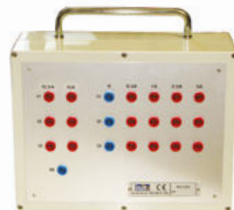
IN 2 CDG - Option for High Burden Relays

For the single phase test of the CDG relay it is possible to have three times the above power, connecting current outputs in series.