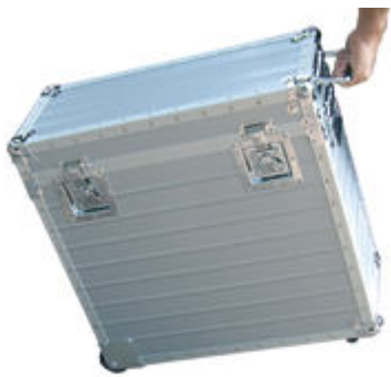
Custodia in alluminio