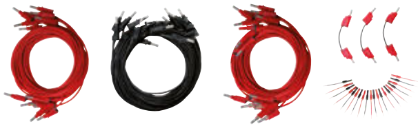
Optional set of testing cables