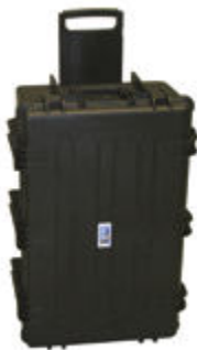
Valigia rigida di trasporto