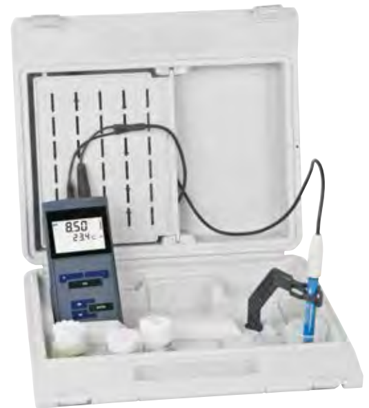
Set in case

The case also serves as a small field laboratory.