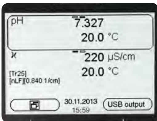
Display with two measured values