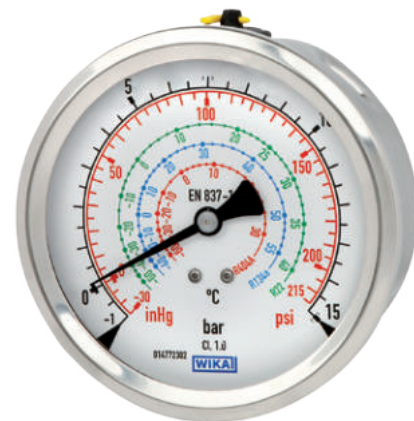
Bourdon tube pressure gauge model 132.28, back mount, lettering for refrigeration technology