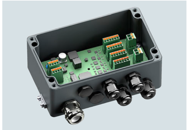
Internal view of SIWAREX DB

The SIWAREX DB is a digital junction box with a die-cast aluminum housing. The enclosure is dust-protected and splashproof according to IP66 degree of protection.