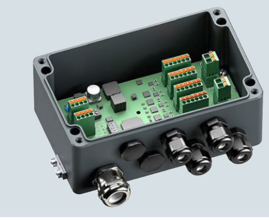
Internal view of SIWAREX DB

The SIWAREX DB is a digital junction box with a die-cast aluminum housing. The enclosure is dust-protected and splashproof according to IP66 degree of protection.