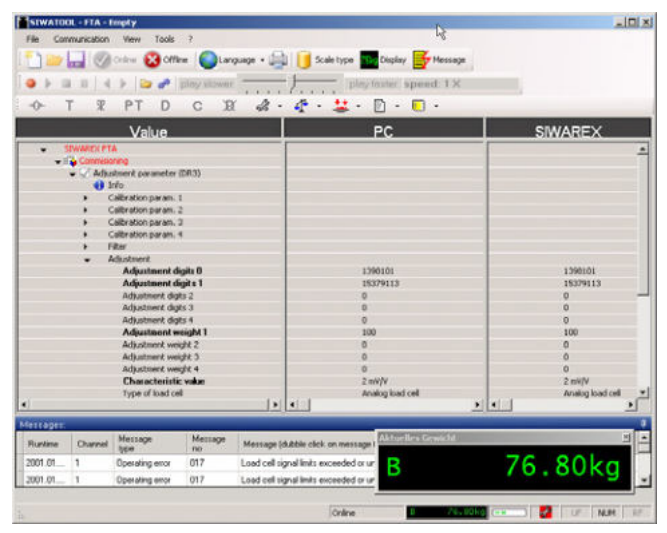
Settings in SIWAREX FTA software

It is extremely helpful to analyze the diagnostics buffer, which can be saved together with the parameters from the module in a backup file.