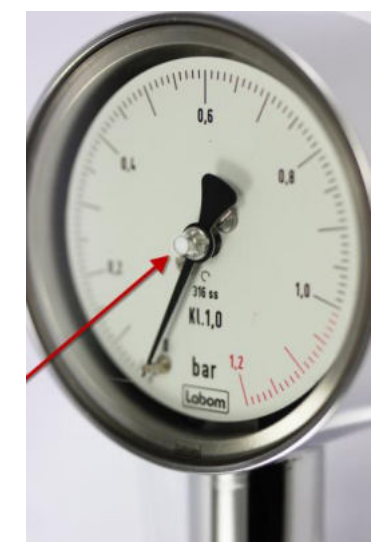
Figure 3: Vent element in the front glass

No activity is necessary prior to commissioning with ventilation systems positioned in the front glass, like for type series BH8xxx (Figure 3). Avoid contaminating the vent element.