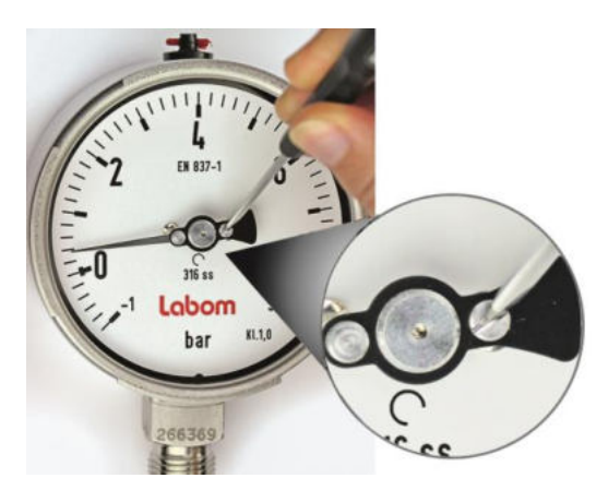
Figure 4: Zero-point correction

You can find further information about zeroadjustment of pressure gauge with micro adjustment pointer in the document TA_029 on www.labom.com.