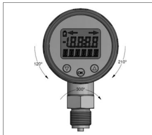
Fig. 2 Rotatability

In order to ensure easy readability even when the device is installed in an awkward location, the display can be rotated into the desired position. Its rotational capability is illustrated below. Note rotation limits.