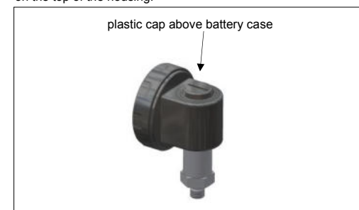
Fig. 3 Battery case

The battery case is located under the black, circular plastic cap on the top of the housing.