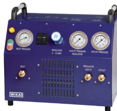
Portable SF 6 transfer unit, model GTU-10