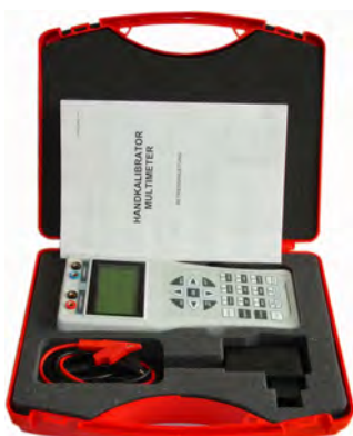
IOC505 with all accessories

Fast signals at the Multimeter input can be stored in up to 8 memory slots with a sampling rate of 1ms. Each Transient contains 256 points and can be assigned to a time period selectable from 0.25s to 300s. The trigger level is programmable