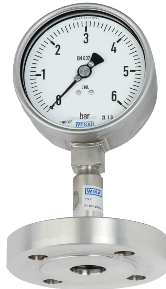
Diaphragm seal system, model DSS26M