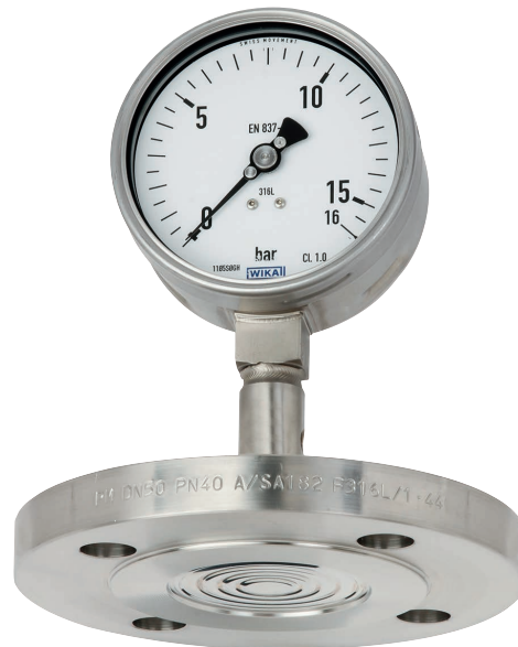
Diaphragm seal system, model DSS27M