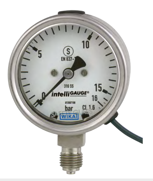
intelliGAUGE, model PGT23.063