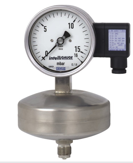
intelliGAUGE® model PGT63HP.100