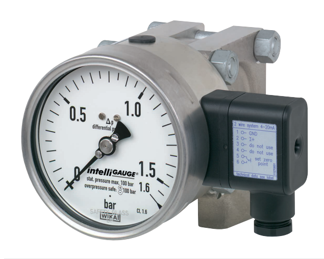
Differential pressure gauge, model DPGT43HP.100