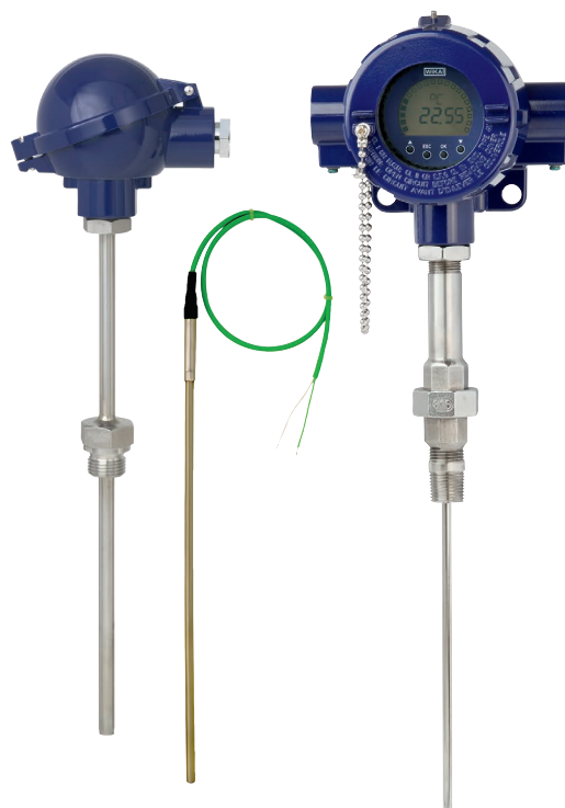
Thermometer in cryo design

The test data from laboratory investigations served as the basis for calculating new polynomials for Pt1000 resistance thermometers in the range of -258 ... -200 °C [ -432 ... -328 °F] which are used in the configuration of WIKA transmitters.