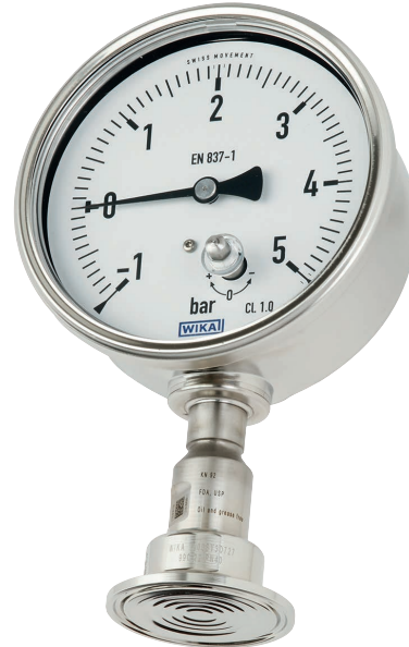
Diaphragm seal system, model DSS22P

The DSS22P complies with all requirements of the pharmaceutical industry. The particular suitability for pharmaceutical products rests on the fact that the measuring point can be cleaned while installed.