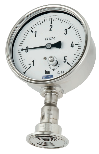
Diaphragm seal system, model DSS22P