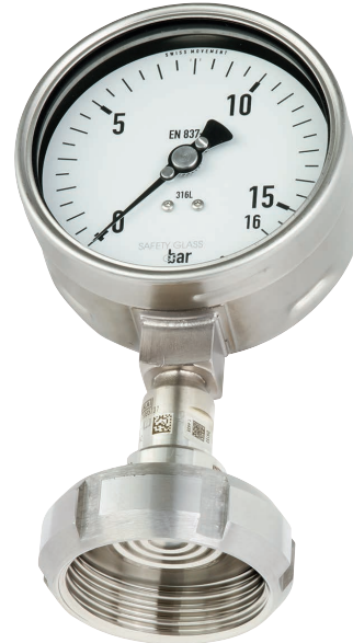
Diaphragm seal system, model DSS19F