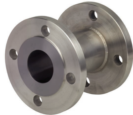
In-line diaphragm seal for flange connection, model 981.27

Pressure gauge or transmitter directly welded, process pressure transmitter with threaded adapter