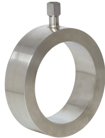
In-line diaphragm seal, cell-type, model 981.10