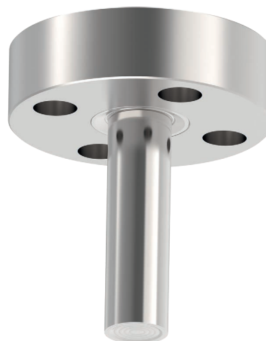
Diaphragm seal for flange connection, model 990.49