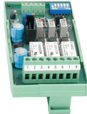
Analogue limit switch, model EGS01