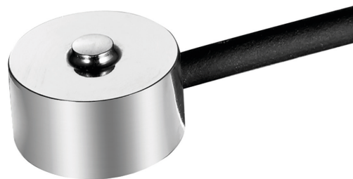
Miniature compression force transducer, model F1814