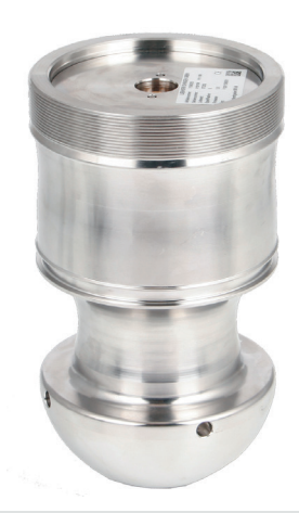
Support force transducer, model F1305