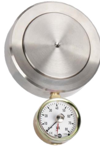
Hydraulic compression force transducer, model F1135