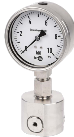
Hydraulic compression force transducer, model F1112