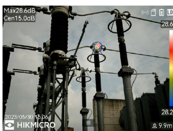
Gas Leak Detection