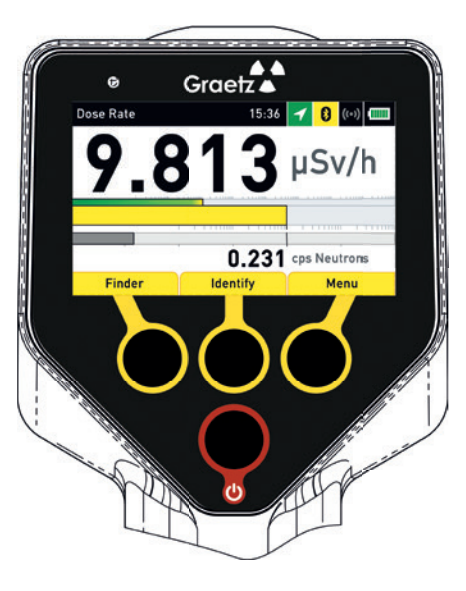
Dose rate mode