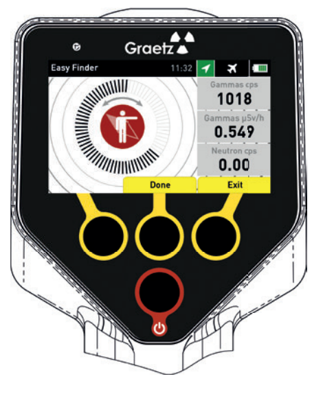
Easy Finder (Scan)