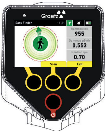
Easy Finder (Direction)