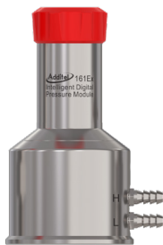
ADT161Ex pressure modules - See ADT161 Datasheet for more info