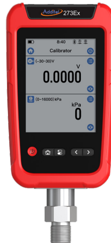
Additel 273Ex with ADT158Ex module