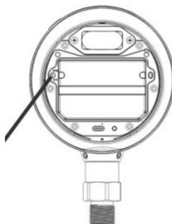
Diagram 5.2 (6 – BP inlet port)