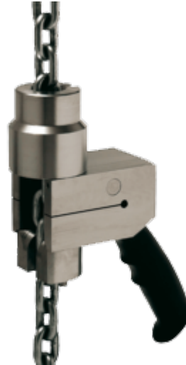
Chain hoist test set, model FRKPS